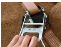
Ratchet lever removable after tightening the belts.

Root ball anchorage system designed specifically for tree plantings on buildings; load distributing and held in place by superimposed load.